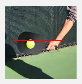
Figure 4-2 (illegal serve)